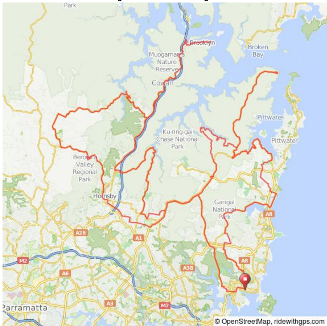
A Gorgeous ride from Fairlight 200

Food/water: This ride is unsupported. However food and water are readily available along the route and at the control locations. At the finish, a number of shops/ cafes are available at Balgowlah.