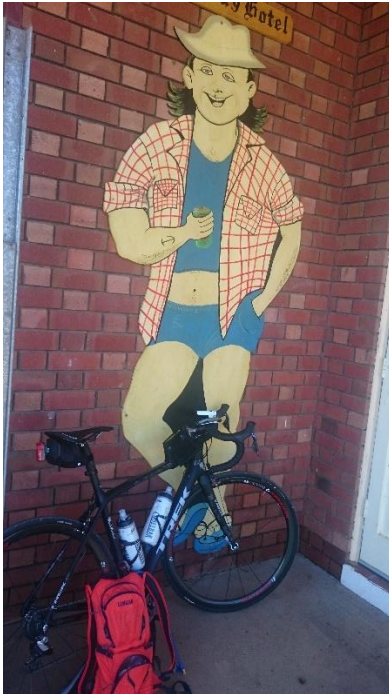
Outside the Bogan Gate Hotel, which also triples as the village's small shop and the village post office.