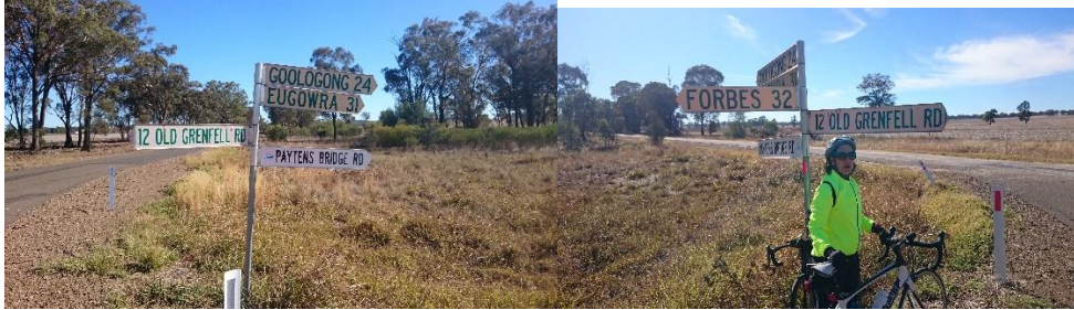
Near the Mulyandry forest

for her. We had backup so I decided to continue on to the finish. Arrived Forbes at 10.57am, 110 k completed. Didn't stop long, Made it to Bogan Gate with a little time up my sleeve so refuelled and had a 20 minute break before continuing on to Parkes via Nelungaloo. 204k all up. All in all a fantastic experience. Arrived back in Parkes at 4.15pm